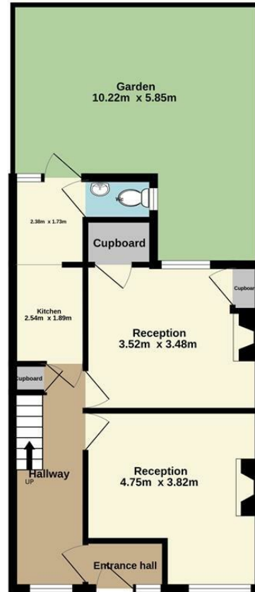
Ground floor 57.7 sq.m. approx.